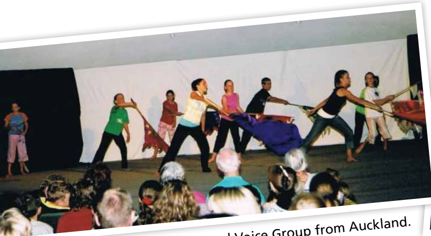
Two visits from the highly talented Voice Group from Auckland.