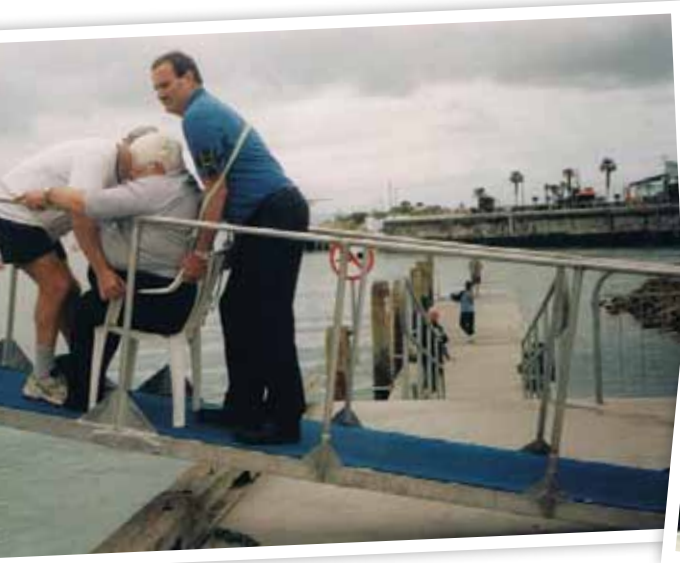
A boat trip on Napier Harbour