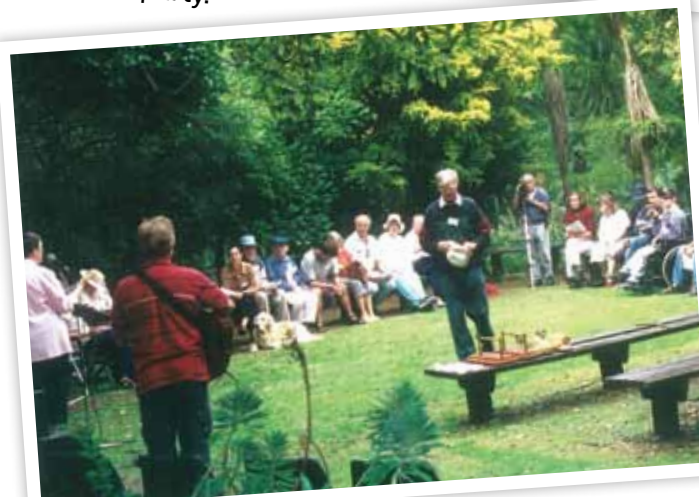
And the 25 year celebrations in Kerunga Gardens