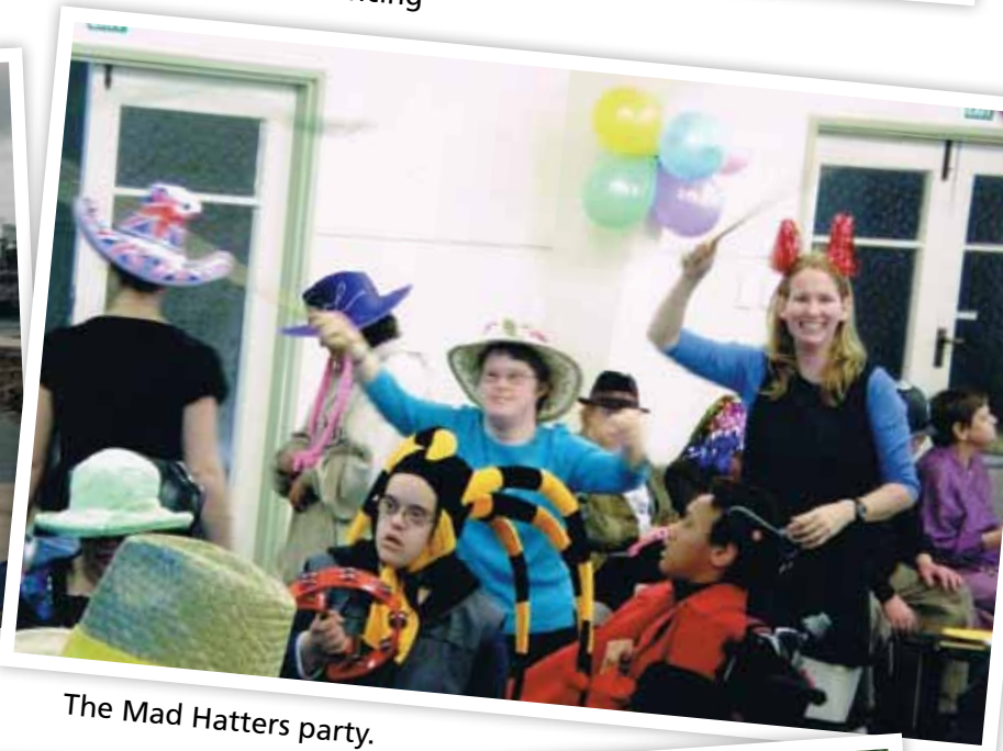
The Mad Hatters party.