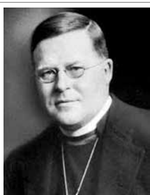
ARCHBISHOP WILLIAM TEMPLE

"The church is the only society (institution) that exists for the benefit of those who are not its members."