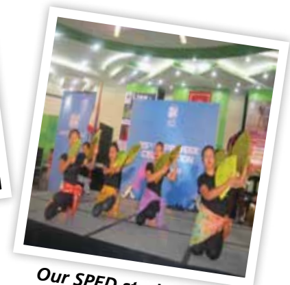
Our SPED students gave a special dance presentation during the events.