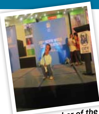
This new member of the group is very talented in singing inspite of his disability, we were all encouraged.