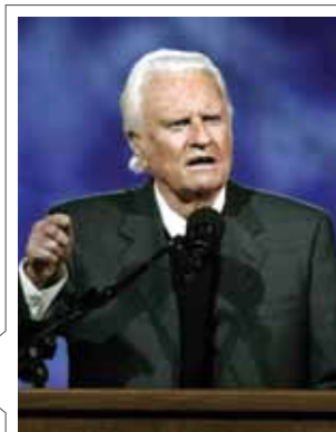
DOCTOR BILLY GRAHAM

"The problems of disabled people will not be solved by more government programmes or better health care, but by the redemptive power of Jesus Christ demonstrated in His people. We need to remind ourselves again that His strength is made perfect in our weakness."