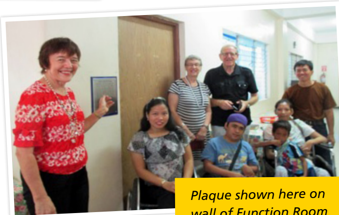
Plaque shown here on wall of Function Room