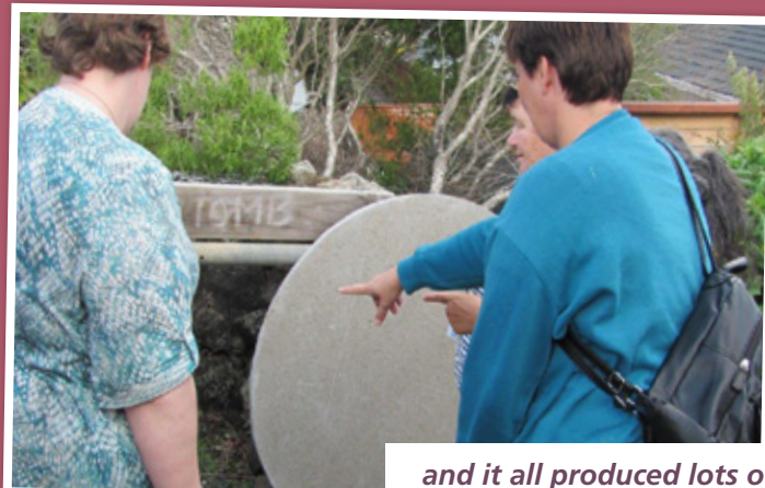
and it all produced lots of thought and discussion