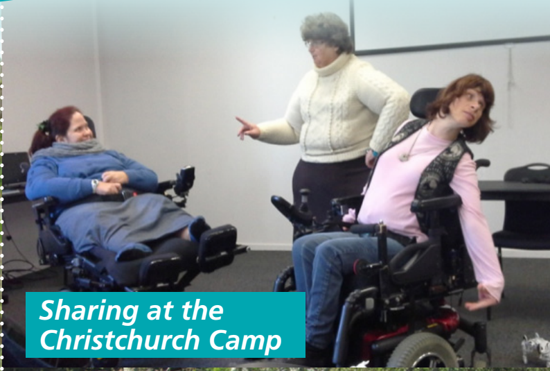
Sharing at the Christchurch Camp