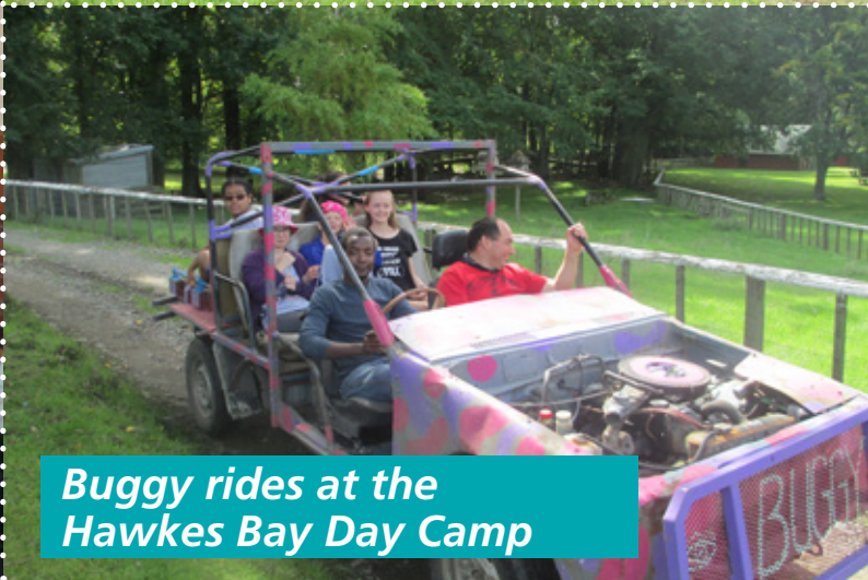
Buggy rides at the Hawkes Bay Day Camp