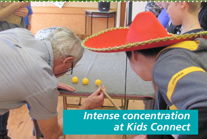
Intense concentration at Kids Connect