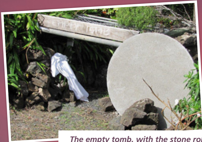
The empty tomb, with the stone rolled away and the clothes of Jesus left behind