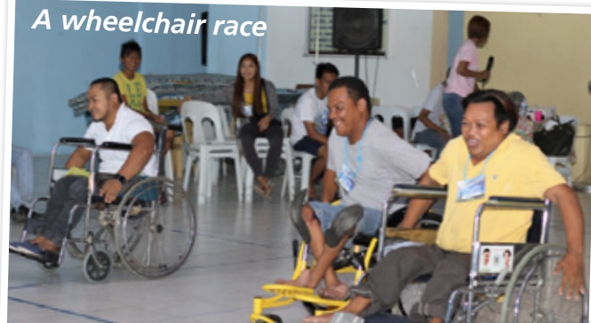
A wheelchair race

Thank you so much for all the people who wholeheartedly donated to our PCFFD Retreat Camp. We really thank God for your lives. You were a channel of blessing for the advancement of God's kingdom. May God continue to bless you more and more!