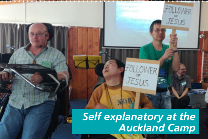
Self explanatory at the Auckland Camp