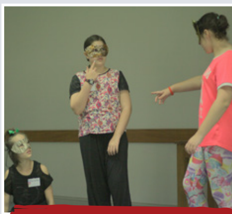
ACTING OUT A PLAY