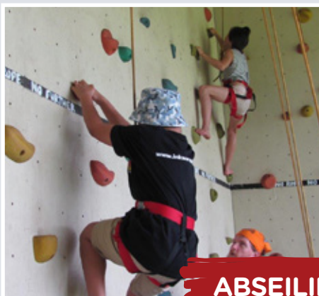
ABSEILING UP THE WALL