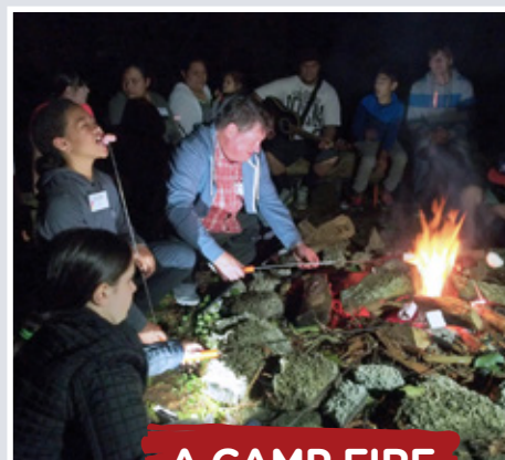
A CAMP FIRE

SO!! DETERMINE TO BOOK EARLY FOR NEXT YEAR'S FAMILY CAMP