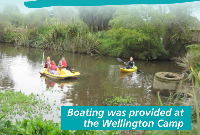
Boating was provided at the Wellington Camp