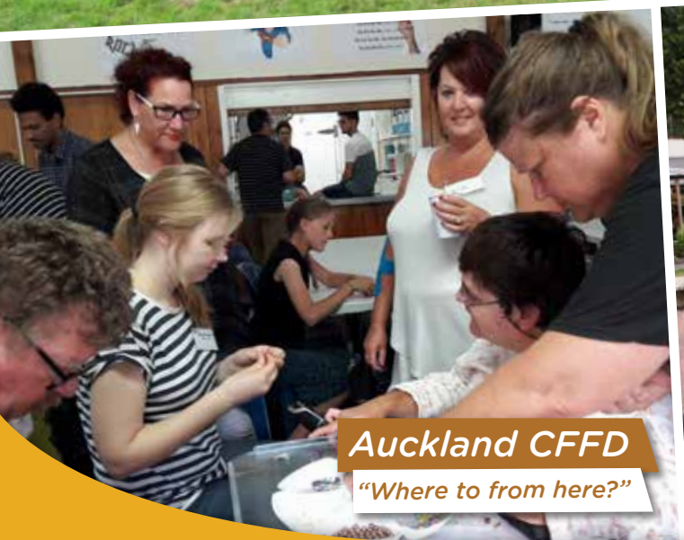
Auckland CFFD "Where to from here?"