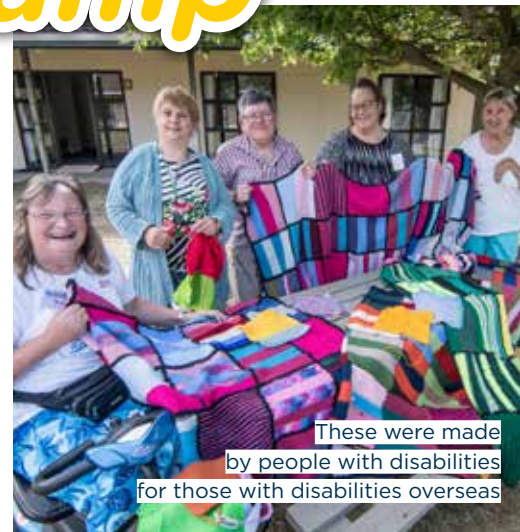
These were made by people with disabilities for those with disabilities overseas