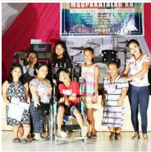
The little people, once shy but now confident to mingle with others.