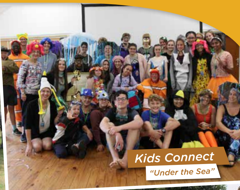
Kids Connect "Under the Sea"