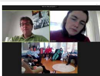
Cabin Time was a great time of connection for those who signed up