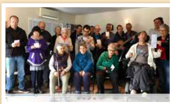
Auckland Central CFFD – for their song about Elevate