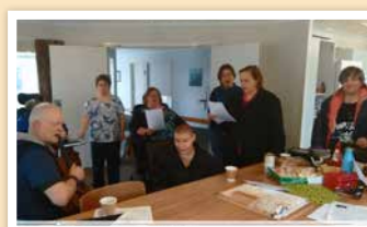
Waikato CFFD – for their performance of Whakaaria Mai