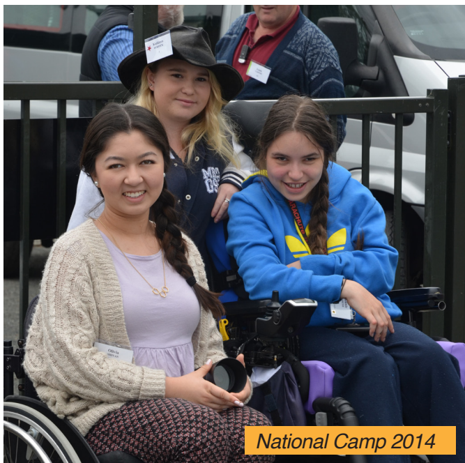
National Camp 2014

feeling connected to a church and accepted in the way that I was when I attended church at 7. After the presentation had finished, I decided to take a chance and attend my first ever National Camp (2011).